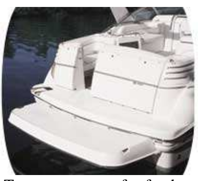
Transom storage for fenders and docklines is easily accessed. A wide swim platform is enhanced by an optional extension.