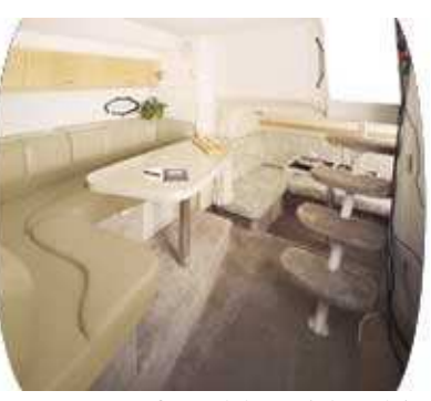
Large comfortable mid-cabin berth with open staircase creates a spacious feeling and converts to an additional dinette area.

Hand-finished maple cabinetry graces the luxurious cabin of the Cabrio 330, which is also fitted with standard Ultra-Leather settee upholstery and a suspended vinyl headliner. The galley features a wood-floor insert and color-matched appliances, plus plenty of