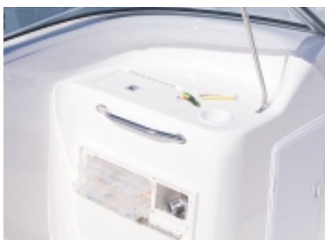
The passenger console is loaded with storage, including built-in tackle drawers.