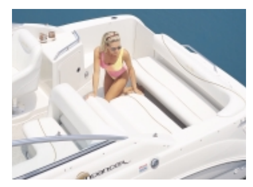
Facing aft seats allow for lots of camaraderie among passengers and converts into a sun lounger.