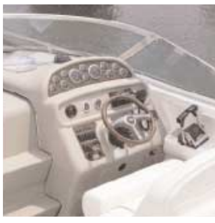
The adjustable double helm seat, with a handy flip-up thigh-rise bolster, faces a control console with full instrumentation, waterproof switches, compass and depth finder.