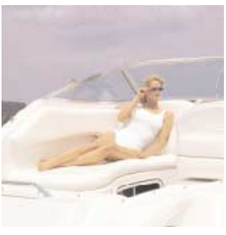
The portside lounger is great for sunning or snoozing.