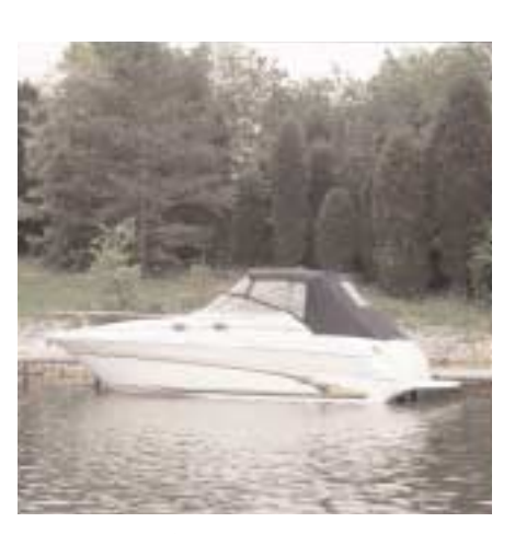
The standard Sunbrella® canvas package includes a bimini top, boot and vertical top storage.