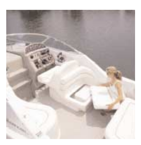
There's plenty of room for family and friends to relax in the spacious cockpit, with a helm seat, aft-facing seat, portside sun lounger and aft bench seat.