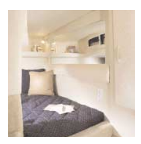
The roomy mid-cabin berth provides superior comfort for guests, with light and ventilation added by an aft-facing screened window and privacy provided by window curtains and a ceiling-to-floor curtain.