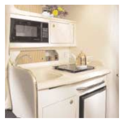
The well equipped galley contains a dual-voltage refrigerator, butane stove, microwave, sink, and plenty of upper and lower storage.