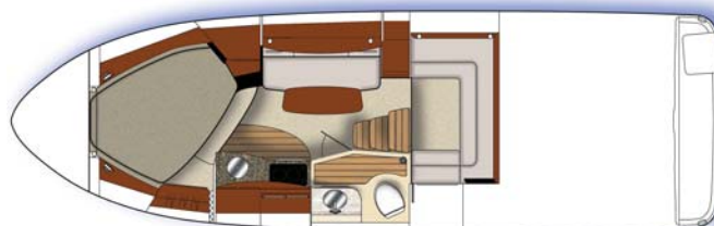
Cabin Layout (A)

NOTE: Boats which are ordered with 220V/50 Cycle Electrical Systems will be installed with the appropriate appliances in the corresponding voltage.