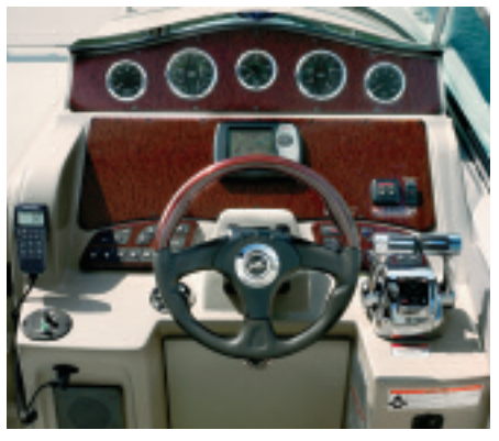
Handsome control station includes a full complement of SmartCraft™ diagnostics, VHF radio and room for a variety of electronic options.

The epitome of elegance, luxury and grace, this magnificent cruiser is the ultimate reward for a lifetime of excellence. Upscale features include state-of-the-art navigational technology, an open airy cabin with extralarge windows, and an amazing amount of storage space.