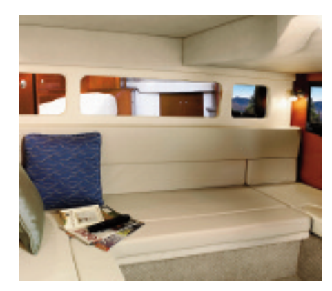
Cozy conversation pit converts to double berth with slide-out base and hide-away privacy curtain.