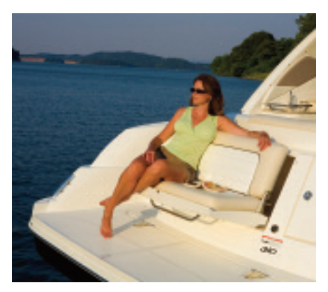
Designed to flip-up and out of the way, this innovative aft-facing "foldaway transom seat" adds versatility to the extra-large integral swim platform.