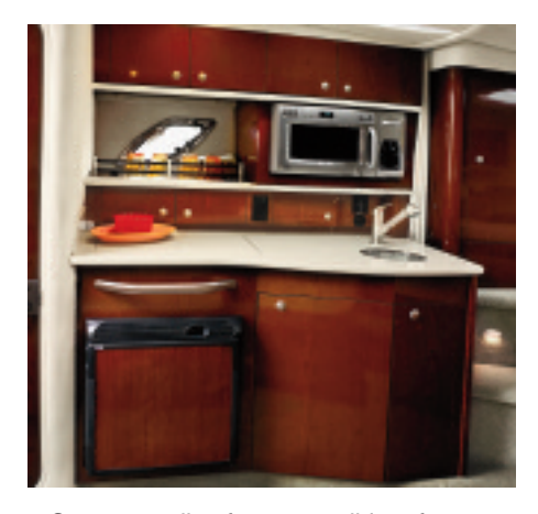
Gourmet galley features solid-surface countertop, microwave/coffeemaker combo, two-burner stove and stainless-steel sink