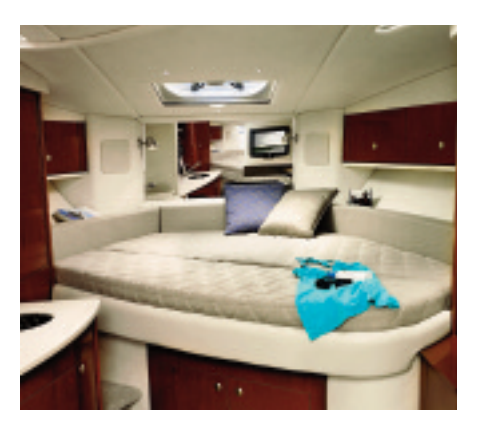
Luxurious, wood-trimmed double V-berth includes roomy storage cabinet with shelves and convenient hanging locker.

Sea Ray Boats, 2600 Sea Ray Blvd., Knoxville, TN 37914. For information call 1-800-SRBOATS or fax 1-636-326-3282. Internet address: http://www.searay.com Note: Not all accessories shown in pictures or described herein are standard equipment or even available as options. Options and features are subject to change without notice. Not all model year boats may contain all the features or meet the specifications described herein. Confirm availability of all accessories and equipment with an authorized Sea Ray dealer prior to purchase. Printed in the U.S.A. August, 2008 ©Sea Ray Boats. 082608