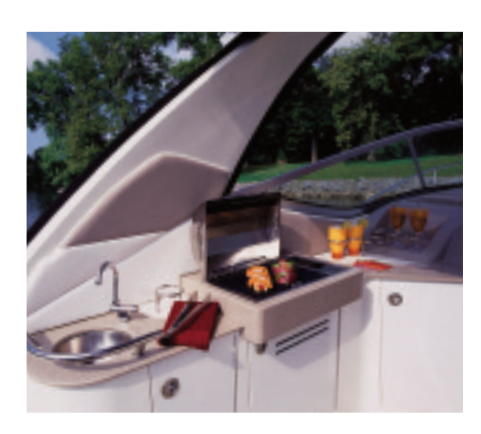
Extra-large cockpit wet bar includes solid-surface countertop and room for optional built-in grill.