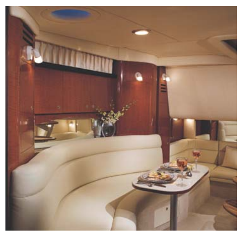
A crescent-shaped sofa in the salon converts to a roomy bed for overnight guests. The salon also features a dinette table with designated storage.

There's plenty of room for family, friends and almost anything you care to bring onboard the sleek new Sea Ray 320 Sundancer. Thanks to the standard power of twin 5.0L MPI Bravo® III MCM stern drives (T-260 hp), you'll have no trouble leaving your daily routine at the dock as you enjoy hours of relaxing fun on the water. For extended excursions, this stylish cruiser with its bold, new profile offers plenty of sleeping accommodations.