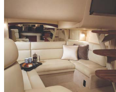
From the salon, step down to the conversation area, which includes seating that converts to a double berth with slide-out base. Overnight guests will appreciate the privacy curtain here.

Sea Ray Boats, 2600 Sea Ray Blvd., Knoxville, TN 37914. For information call 1-800-SRBOATS or fax 1-636-326-3282. Internet address: http://www.searay.com Note: Not all accessories shown in pictures or described herein are standard equipment or even available as options. Options and features are subject to change without notice. Not all model year boats may contain all the features or meet the specifications described herein. Confirm availability of all accessories and equipment with an authorized Sea Ray dealer prior to purchase. Printed in the U.S.A. July 2003 ©Sea Ray Boats.