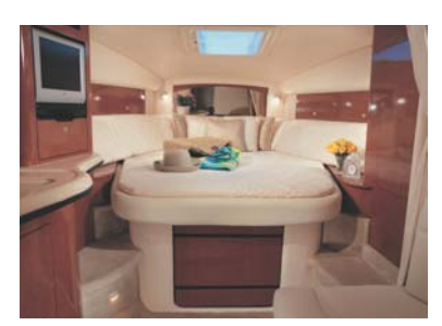
The spacious V-berth sleeps two comfortably on the built-in island-style double bed with storage drawers below. Enjoy the entertainment package that includes Clarion® AM/FM stereo with six-disc CD changer and six speakers.