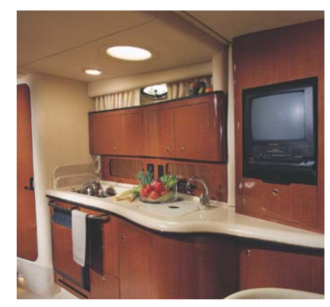
Faux granite countertops and the cherry wood package with Formica® cabinets add to the feeling of luxury. The galley also features a refrigerator, microwave, two-burner electric stove and lots of storage.

There's plenty of room for family, friends and almost anything you care to bring onboard the sleek new Sea Ray 320 Sundancer. Thanks to the standard power of twin 5.0L MPI Bravo® III MCM stern drives (T-260 hp), you'll have no trouble leaving your daily routine at the dock as you enjoy hours of relaxing fun on the water. For extended excursions, this stylish cruiser with its bold, new profile offers plenty of sleeping accommodations.