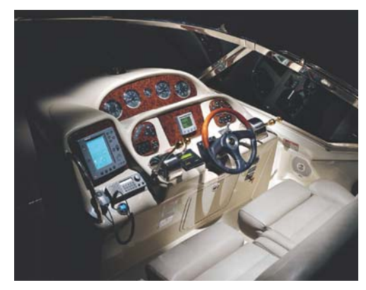
This broad, burl-trimmed dash places everything you need, right where you need it. Filled with SmartCraft™ diagnostics, waterproof electronic switch pads, and plenty of room for additional electronics, the captain has everything necessary for an enjoyable day on the water.