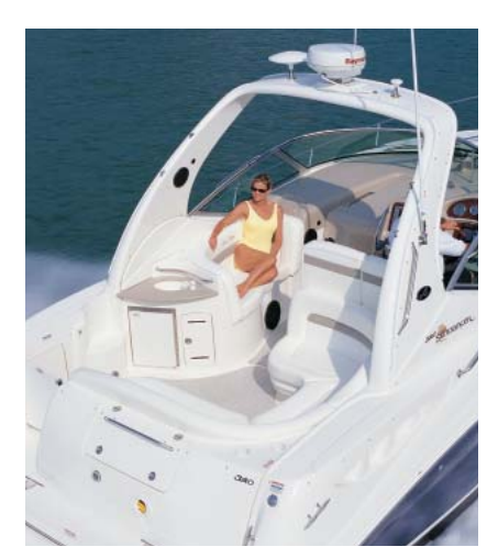
There's plenty of room for company with a custom adjustable companion helm seat with thigh-rise bolsters, curved lounger seat to port, and U-shaped aft seating with fiberglass storage base. The cockpit also offers a wet bar with stainless steel handrail and storage below.