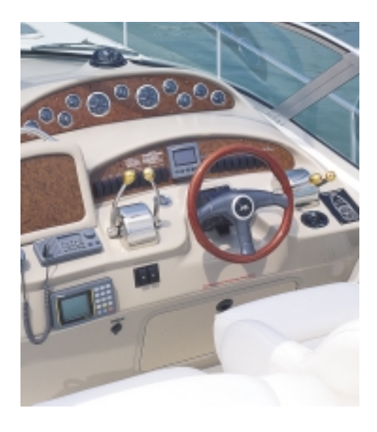
The broad dash places everything in easy sight and reach, including illuminated weatherproof rocker switches, custom backlit instrumentation, tachometer with hourmeter, compass, digital depth finder and VHF radio.