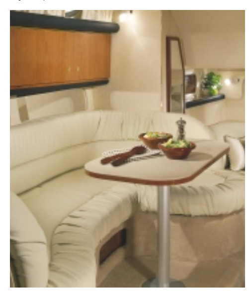
A plush, overstuffed sofa with a dining table that can be stored underneath encompasses the entire starboard side of the salon. For overnight guests, the sofa converts to a double berth. Note: shown with optional Vitricor®.