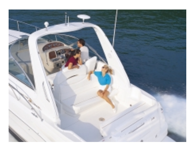
The large cockpit has everything for relaxing and entertaining, including a helm seat with flip-up thigh-rise, companion seat and aft-facing seating, plus a refreshment center with wet bar and cooler.