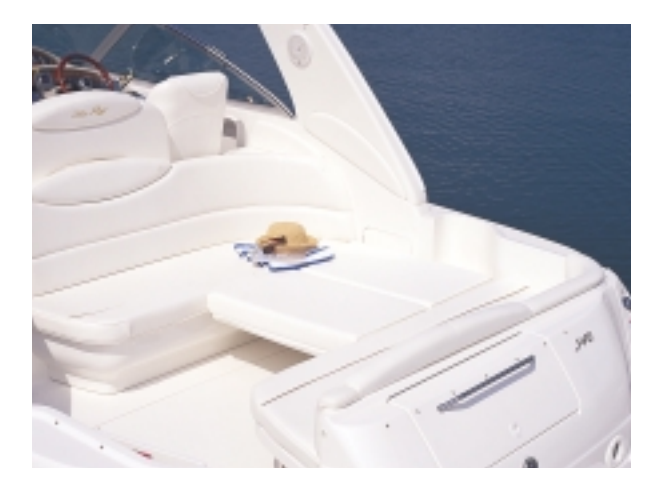
The cockpit table and cushion turn the seats into a comfortable sun pad.