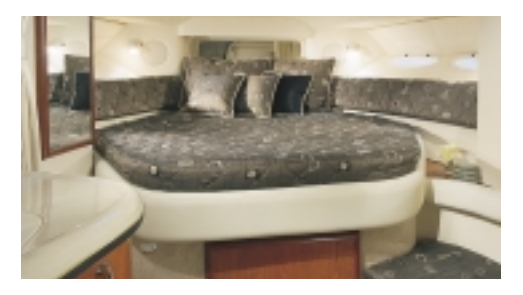
The forward V-berth features an island bed with storage beneath, hanging lockers, a privacy curtain, and port lights for natural light.