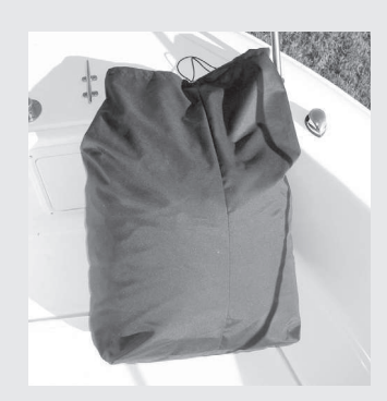
Storage Bag for Cover Protect your T-Top Boat Cover while not in use.