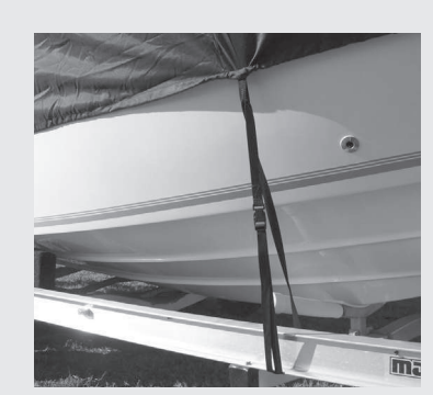
Adjustable Tie Down Straps Nine adjustable straps hold down T-Top Boat Cover to trailer sides.