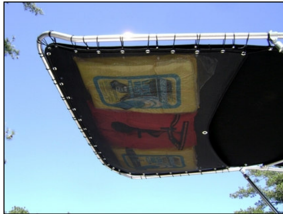
Shadow Gear Loft with 3 PFDs