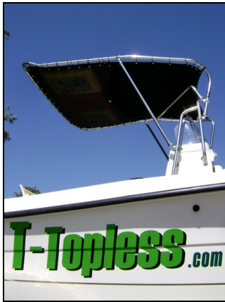
Shadow T-Top with Gear Loft