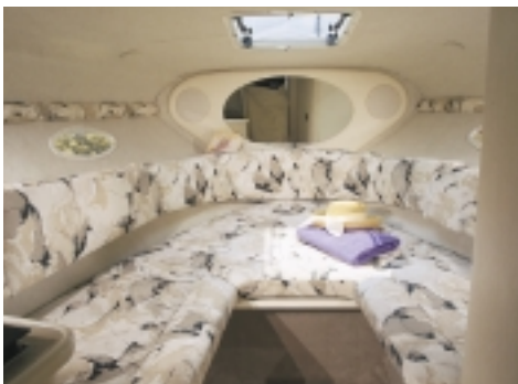
A cushioned V-berth with storage below provides opportunities for comfortable relaxation out of the sun; lockable cabin door ensures privacy.