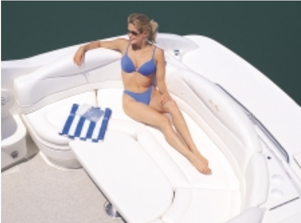
Wraparound seating accommodates five adults, and the optional aft sun pad with filler cushion converts to a full sun lounger.