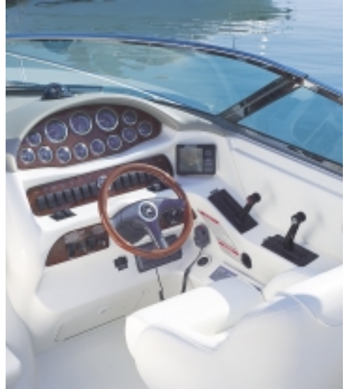
The adjustable captain's chair with fiberglass storage base is both functional as well as comfortable and provides an excellent view of the complete instrumentation, including a remote control for the Clarion® stereo.