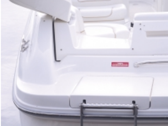
The large swim platform provides a hatch for concealing the swim ladder.