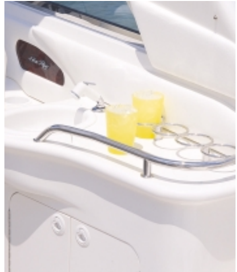
To starboard, the entertainment center with sink, glass rack and removable cooler offers a place to prepare meals and snacks.

Sea Ray Boats, Inc., 2600 Sea Ray Blvd., Knoxville, TN 37914. For information call 1-800-SRBOATS or fax 1-314-213-7878. Note: Not all accessories shown in pictures or described herein are standard equipment or even available as options. Options and features are subject to change without notice. Not all model year boats may contain all the features or meet the specifications described herein. Confirm availability of all accessories and equipment with an authorized Sea Ray dealer prior to purchase. Printed in the U.S.A. August 1999 © Sea Ray Boats, Inc., MRP#1331040