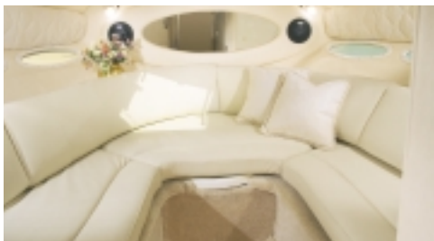
With the dinette table stowed the V-berth converts into a comfortable and luxurious conversation area.

2000 | S P O R T C R U I S E R S P E C I F I C A T I O N S