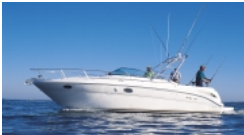
With the addition of an optional fishing package, the 290 Amberjack can become an angler's dream.