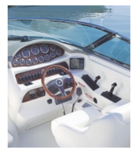
The adjustable captain's chair with fiberglass storage base is both functional as well as comfortable and provides an excellent view of the complete instrumentation, including a remote control for the Clarion® stereo.