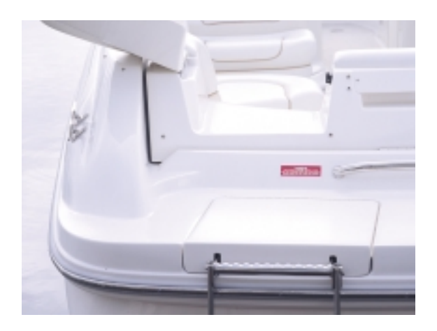
The large swim platform provides a hatch for concealing the swim ladder.