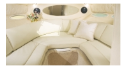
With the dinette table stowed the V-berth converts into a comfortable and luxurious conversation area.