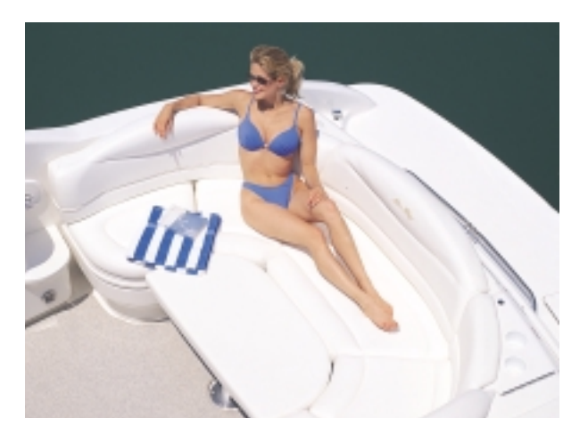
Wraparound seating accommodates five adults, and the optional aft sun pad with filler cushion converts to a full sun lounger.