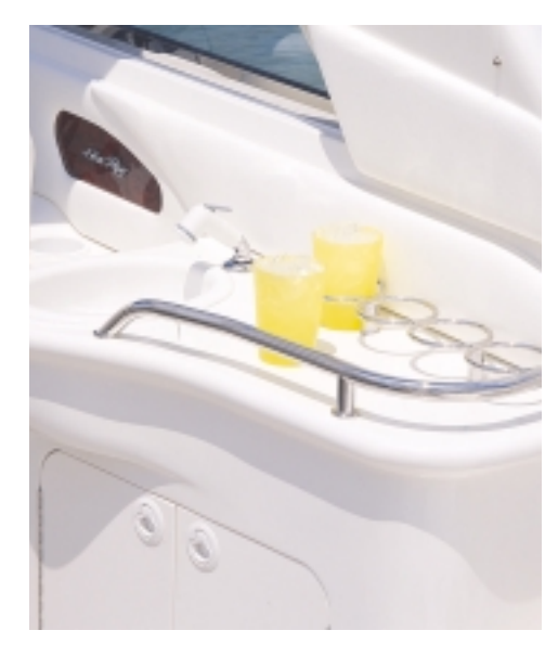
To starboard, the entertainment center with sink, glass rack and removable cooler offers a place to prepare meals and snacks.