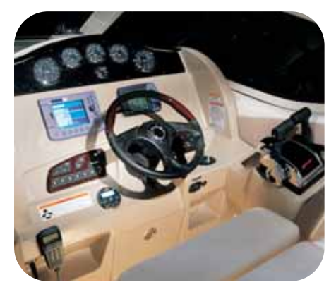
Handsome control station features high-gloss black coral and burl instrument panel with SmartCraft™ diagnostics and wood-accented tilt steering wheel.

This all new 290 Sundancer offers a wealth of upgraded features including fiberglass arch top with aft sunshade, Sirius® satellite receiver with six months activation and optional colored hull. Full canvas enclosure with aft curtain is also included, plus electrically activated engine hatch and optional underwater swim platform lighting.