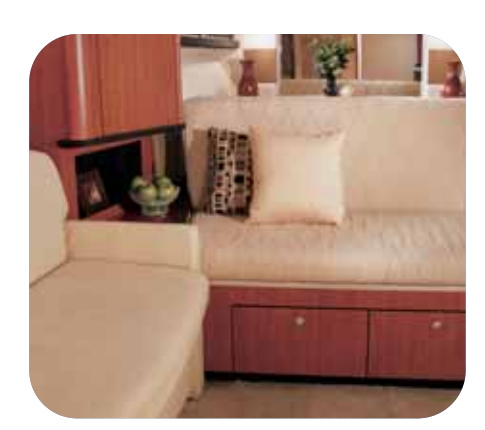
Unique full-size island V-berth converts to comfortable salon seating with plenty of storage below. Privacy curtain, hanging locker, and gunwale shelving is also included.