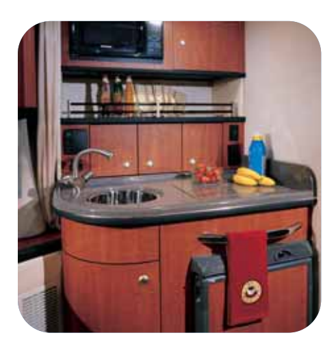
Wood finish is available in this wellappointed cabin featuring fully outfitted galley and optional 15" flatscreen TV with DVD player.