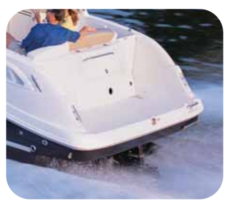
Integral swim platform includes concealed stainless steel four-step swim ladder and optional underwater lighting.