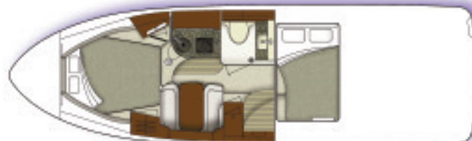
Optional Cabin Layout (Shown w/Optional Opposing Dinette Seating)

NOTE: Boats which are ordered with 220V/50 Cycle Electrical Systems will be installed with the appropriate appliances in the corresponding voltage.