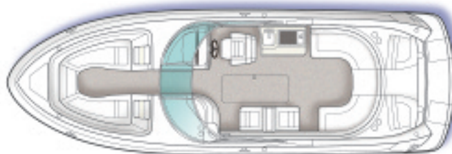
Standard Seating Plan

Stereo, Premium Cockpit Sound System, Polk® MOMO w/6-Disc CD Changer, Upgraded Component Speakers, Amplifiers, Subwoofer & Transom Stereo Remote Stereo Remote Control – Additional Unit on Transom Swim Platform, Extended Table, Bow w/Filler Cushions VHF Radio 3.5' Stainless-Steel Antenna & Stainless-Steel Ratchet Mount Windlass, Rope/Chain Storage Cradle CE Option