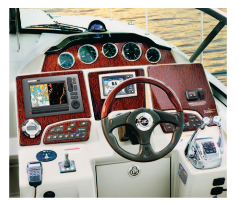
Take command from the burlwoodaccented helm, which features SmartCraft<sup>®</sup> diagnostics, digital throttle and shift, a VHF radio, and room for almost every electronics upgrade in the book.

The 350 Sundancer proves that Sea Ray is always pushing into new and rewarding territory. Four oversized hull windows contribute to enhanced interior visibility and ambient light. There's a clever aft-facing transom seat, optional cockpit barbeque and flatscreen TV, and an electrically adjustable forward berth. A plunging sheer line and contoured fiberglass sport spoiler are sure to grab attention wherever you go. Choose your preferred power from gas or diesel sterndrives or inboards.