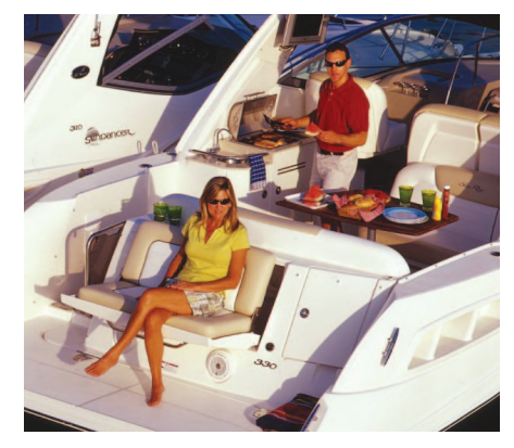
Watch the kids splash around behind the boat, don your water sports gear, or simply take in a wonderful sunset from the foldaway transom bench. There's still room to store fenders and gear here, too.