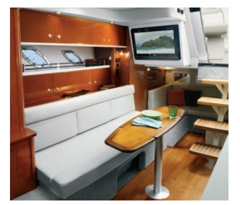
Entertaining in the cabin is easy thanks to plush Ultraleather<sup>™</sup> seating, a mid-cabin conversation area, and a flatscreen TV with remote DVD player and premium Sony<sup>®</sup> stereo system.