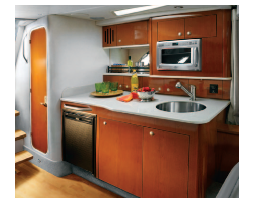
Get cooking in the spacious galley with solid-surface countertop, microwave, refrigerator, and recessed two-burner stove with cover. A second refrigerator drawer adds space on longer cruises.