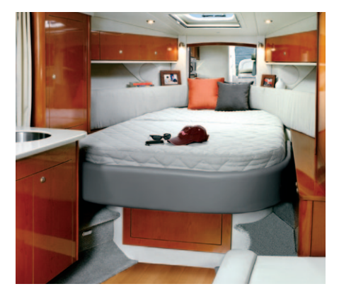
The gorgeous V-berth has all the extras you've come to expect from Sea Ray, including an electrically adjustable extension and Posturpedic<sup>®</sup> backrest with Visco elastic foam mattress.

Sea Ray Boats, 2600 Sea Ray Blvd., Knoxville, TN 37914. For information, fax 1-636-326-3282. Internet address: http://www.searay.com Note: Not all accessories shown in pictures or described herein are standard equipment or even available as options. Options and features are subject to change without notice. Not all model year boats may contain all the features or meet the specifications described herein. Confirm availability of all accessories and equipment with an authorized Sea Ray dealer prior to purchase. Printed in the U.S.A. August 2010 ©Sea Ray Boats. 102010