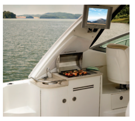
Four options that take the cockpit to a new level: a stainless-steel barbeque grill, removable flatscreen TV, and refrigerator or icemaker. The wet bar with solid-surface countertop is standard.