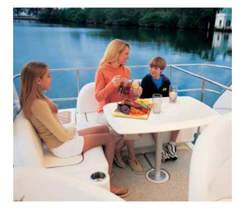
The bridge offers plenty of seating including an aft sofa and portside chair plus a convenient table for games or casual dining.