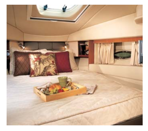
Comfortable forward stateroom features full-size innerspring mattress, pocket sliding privacy door with fulllength mirror, hope chest with seaing, in-floor storage and 15" flatscreen TV/DVD combo.

Sea Ray Boats, 2600 Sea Ray Blvd., Knoxville, TN 37914. For information call 1-800-SRBOATS or fax 1-636-326-3282. Internet address: http://www.searay.com Note: Not all accessories shown in pictures or described herein are standard equipment or even available as options. Options and features are subject to change without notice. Not all model year boats may contain all the features or meet the specifications described herein. Confirm availability of all accessories and equipment with an authorized Sea Ray dealer prior to purchase. Printed in the U.S.A. June 2006 ©Sea Ray Boats. PUB081806