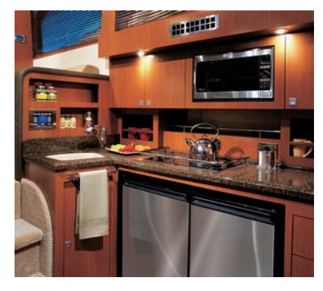
Gourmet galley includes solid-surface countertop, wood flooring, undercounter freezer and refrigerator with stainless-steel fronts, microwave, two-burner stove and built-in coffeemaker.