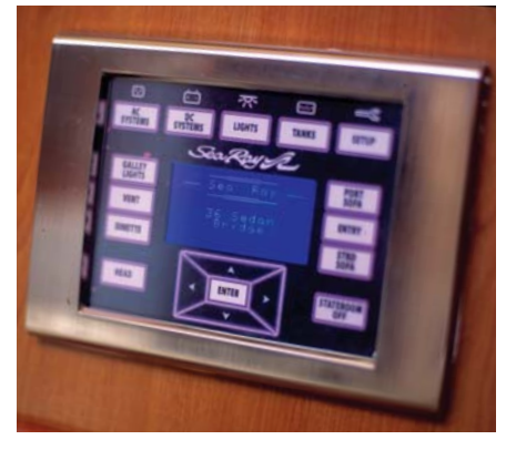
New state-of-the-art electronic power distribution system with 10.4" touchscreen monitor and touch-pad wall switches lets you control a full range of electronic functions from below deck.